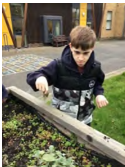
Clearing the weeds.

We cleared the weeds, quite a job! Then we sowed the seeds, now comes the tricky bit – remembering to check on them and water them, hoping the weather helps us out with some nice sunny warm days soon.