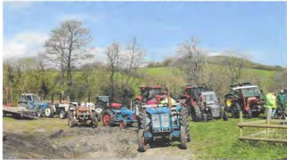
Friends of Mountjoy School are holding a Charity Tractor & Vintage Vehicle Road Run in & around The West Dorset area in aid of Mountjoy School.